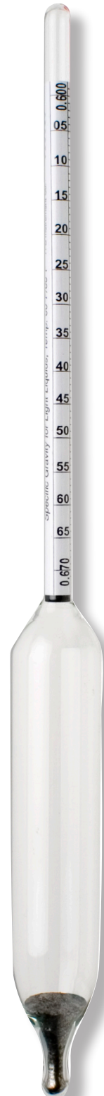
Specific Gravity Hydrometer